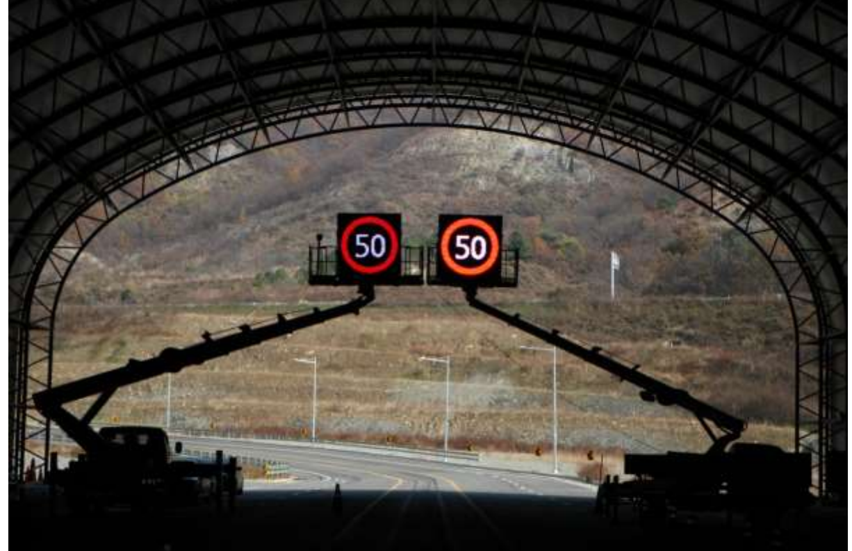
Fig 4. Comparison between conventional VSLs(L) and developed VSLs(R) at normal weather