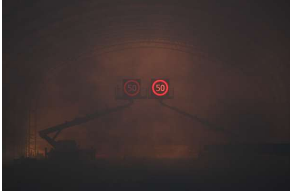
Fig 5. Comparison between conventional VSLs(L) and developed VSLs(R) at foggy condition