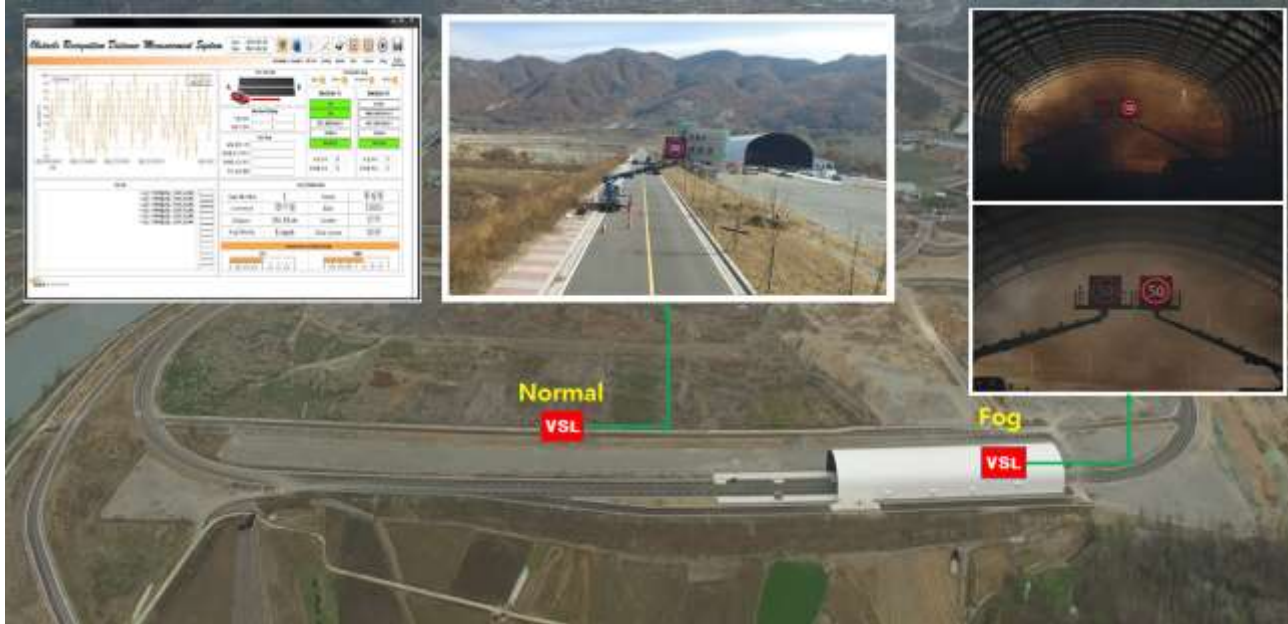
Fig 2. Layout of off-road test

In this study, improved performance of VSLs at normal weather and foggy condition was evaluated in a way of comparing the legibility distance of the driver. The test was conducted at KICT's SOC Yeoncheon R&D center on test bed and tunnel shield. The foggy weather was simulated over a 200m-long tunnel shield and the overall layout is as Fig 2 below.